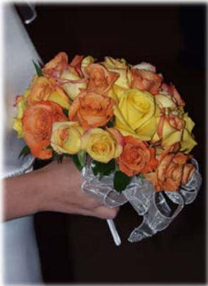
Uploading wedding images, like this one captured by Fisher, is a popular use of SeeYourPhotos.net.